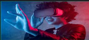
XR & technology demonstrations