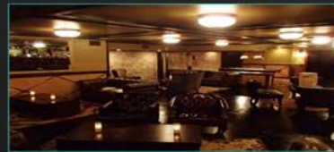
Private/dedicated space for top clients, talent & media