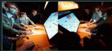
Live action gameplay & challenge-style competitions