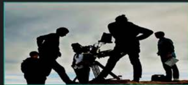
Media partners & film/video crews capturing moments, interviewing top talent from the festival & creating content